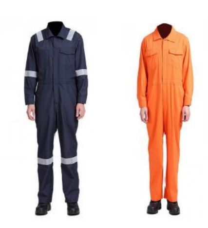
100% Cotton Fire Retardant Garment. GSM: 220 to 350 - Made in Pakistan

Construction Safety Uniforms | Safety Coverall Welder Fire Retardant Coverall | Fire Retard Hoods